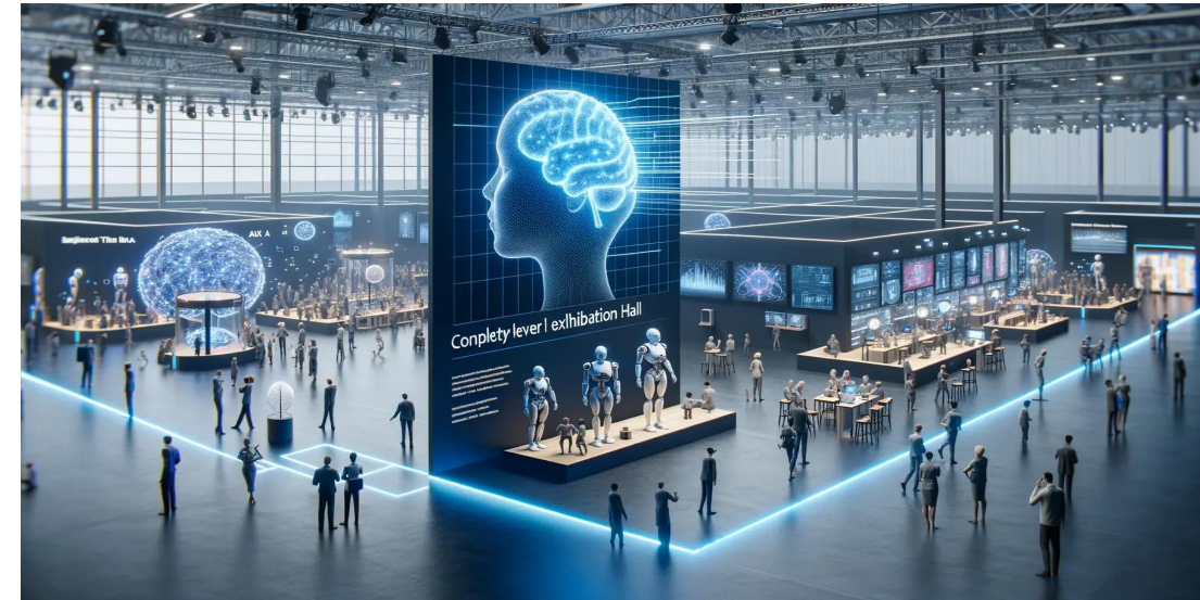
The image is for illustrative purposes only. Actual area image will be released around June.

CEATEC 2024 Exhibition Hall/International Conference Hall)