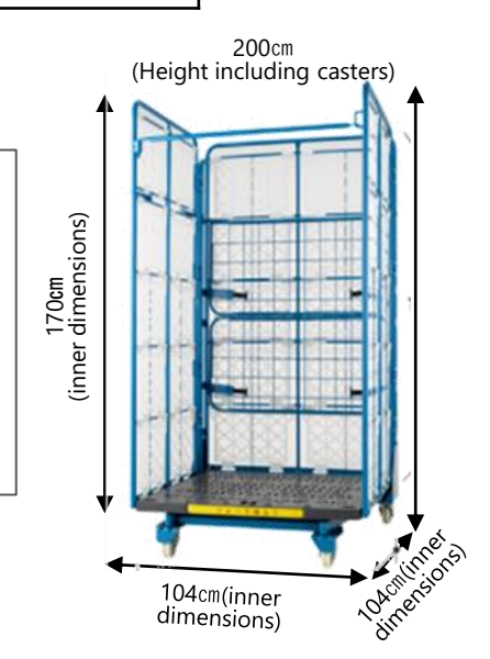
Max. load capacity 500 kg